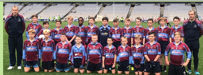
A huge congratulations to the team from St. Cronan's SNS who won the Cumann na mBúnscoil in Croke Park on Wednesday this week.

€4. (Texts cost €4. World Mission Ireland will receive a minimum of €3.60. Service Provider: LikeCharity. Helpline: 076 680 5278. Republic of Ireland only.) You can also donate online at www.wmi.ie/donate . Go to www.wmi.ie to learn more about the work of World Missions Ireland, the Church's charity for overseas mission.